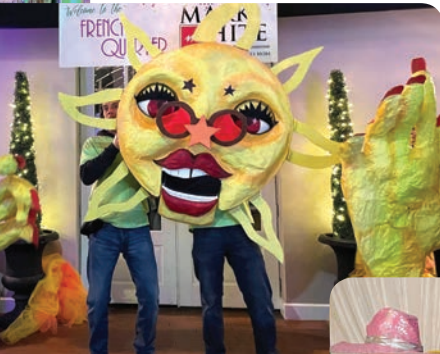
Since this was the 10<sup>th</sup> Annual Mardi Gras Gala, we had 10x the fun with this four-person talking sun puppet from Playful Evolving Monsters .

Throughout the evening, we had some amazing entertainment from fire performers, jugglers, balloon artists, and stilt walkers thanks to our Bourbon Street Sponsor, Chambliss Law .