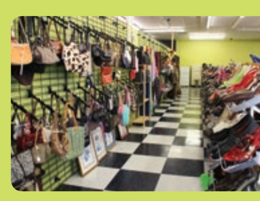
The Thrift Store in Brainerd was recently remodeled.