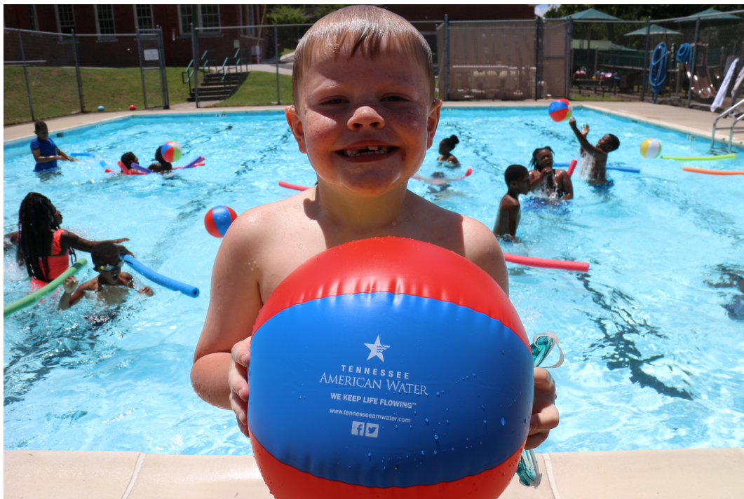
In addition to filling up the agency's pool free-of-cost, Tennessee American Water also provided beach balls, pool noodles, water bottles, and more for the annual party.