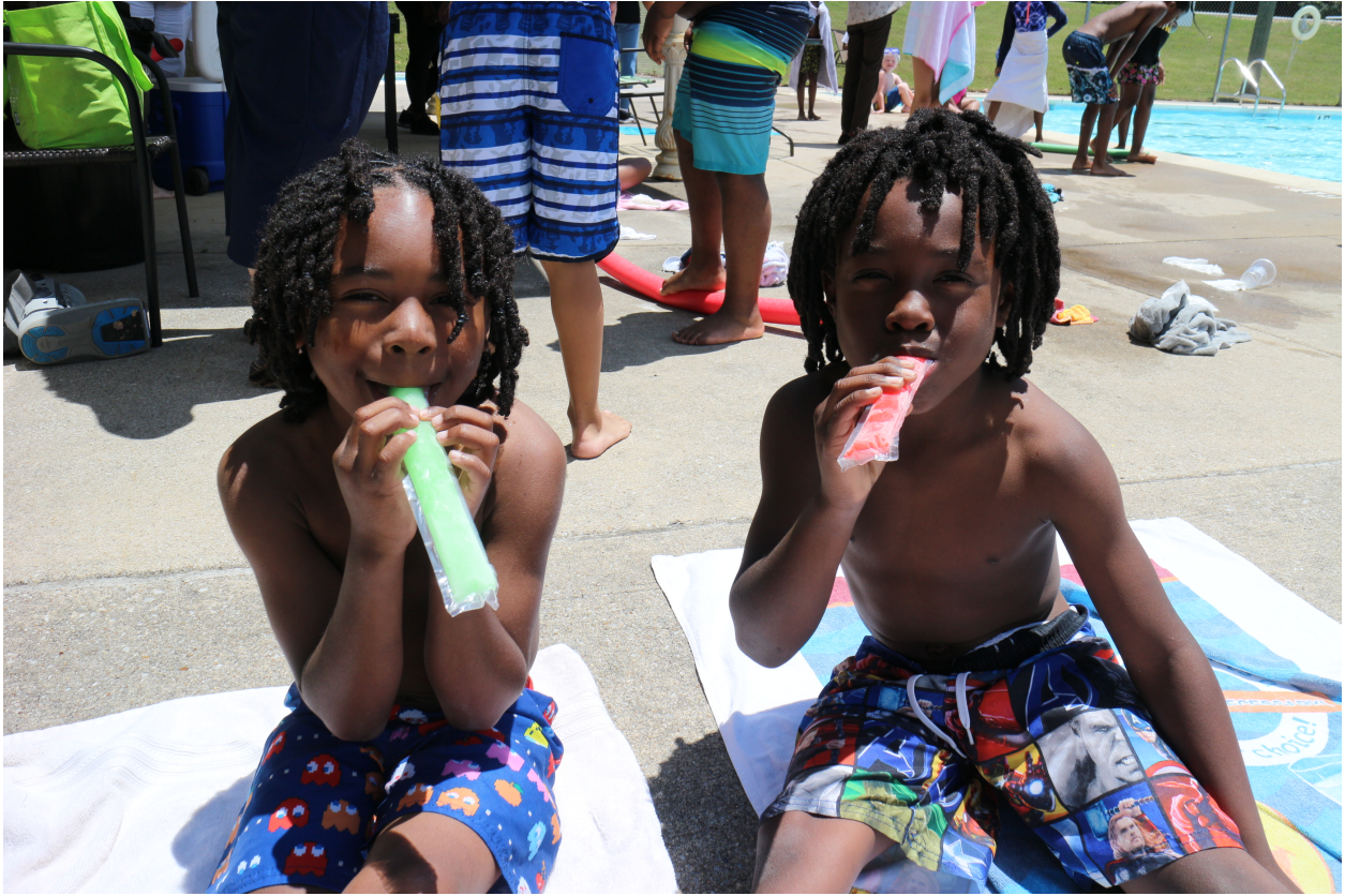
After taking a dip in the pool, these brothers enjoyed popsicles and cookies courtesy of Tennessee American Water.