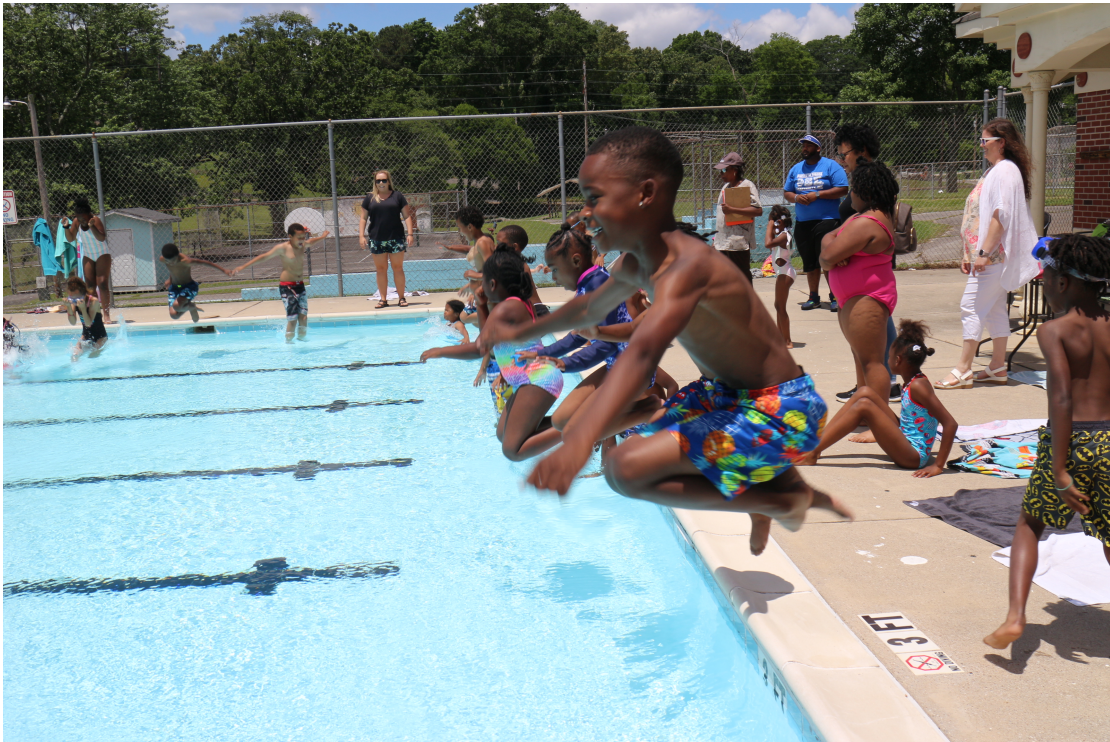
The children in Chambliss Center for Children's Summer Camp Program took the first jump into the 40,000-gallon pool.