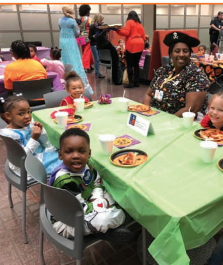
Our Pre-K children enjoyed the pizza party TVA Nuclear hosted for us.