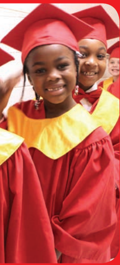
from left to right) are looking