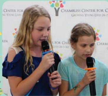
We added Kids' Karaoke this year, which proved to be a very popular activity.