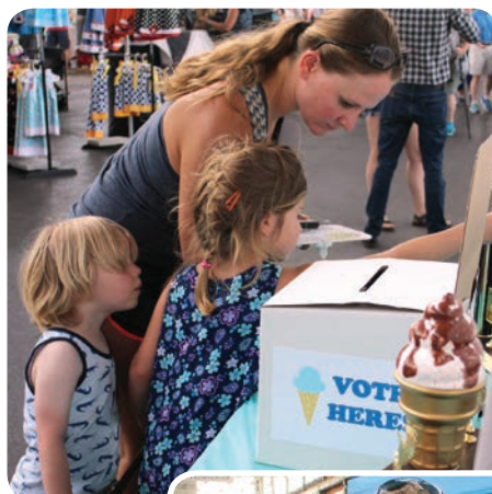
All participants got the opportunity to vote for their favorites.