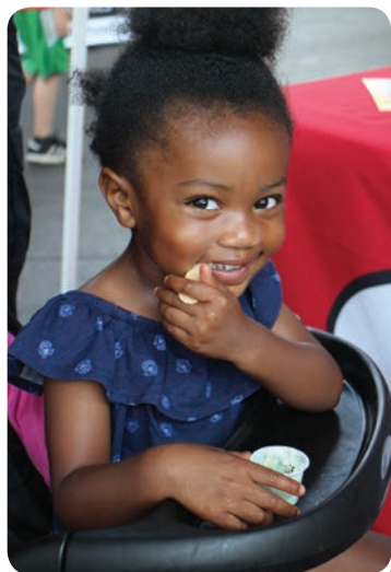
This little cutie was very happy with her sample.