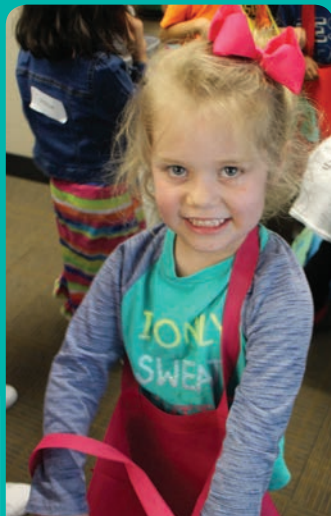
Bentleigh was ready to start collecting Easter eggs.