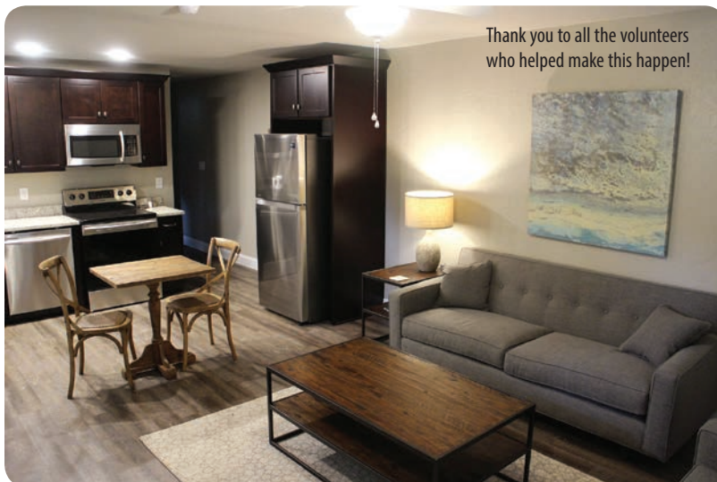
Thank you to all the volunteers who helped make this happen!

One of the ways you can help support these youth is Homemade Mondays! On our web site, www.chamblisscenter.org , you can sign up to bring a homemade meal for our youth. They love this, and it strengthens the message that this community is here to support them.