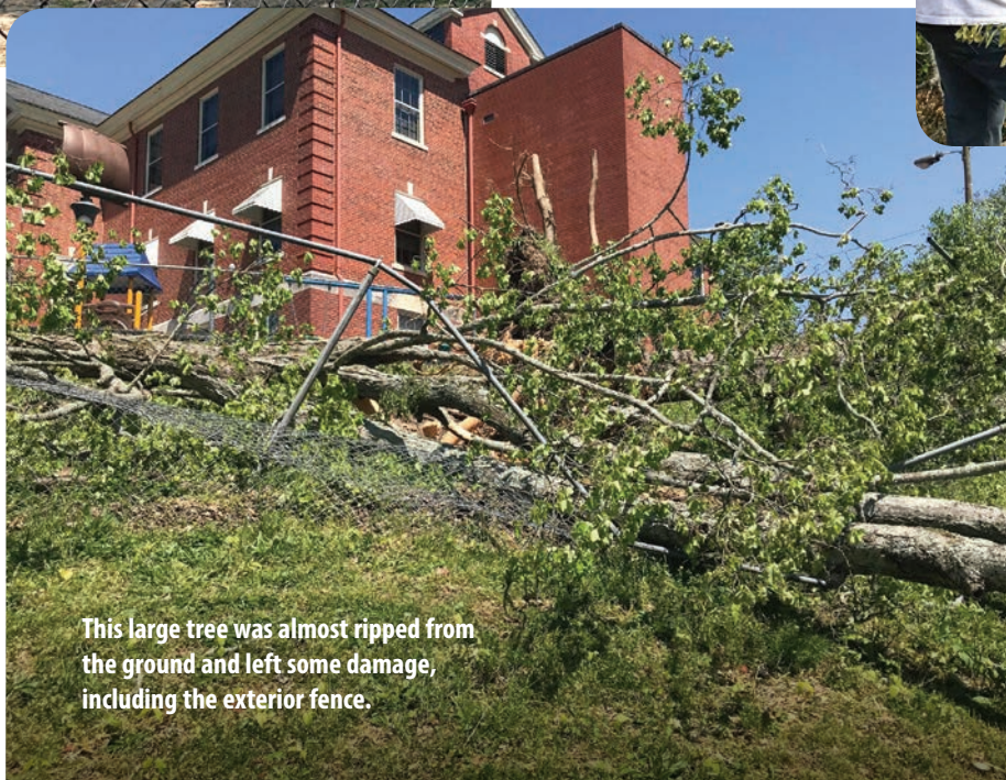
This large tree was almost ripped from the ground and left some damage, including the exterior fence.

Our agency was very fortunate to sustain little damage when a storm and tornado hit the Metropolitan Chattanooga community in April. We did have one large tree fall over on our lawn, and the project required a little extra help to remove it. Thankfully, several volunteers came ready with chainsaws to start cutting the bulky tree into manageable pieces. After that, Joshua Sexton was able to remove the remainder of the tree to make our grounds look as good as new!