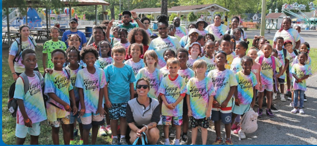
Our school-age children and their chaperones couldn't have been happier to touch down at Lake Winnepesaukah.