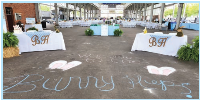
A beautifully decorated entrance welcomed Bunny Hop! guests.