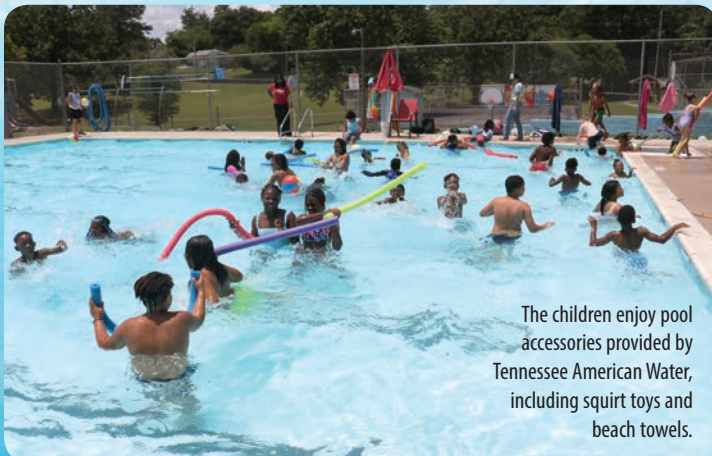
The children enjoy pool accessories provided by Tennessee American Water, including squirt toys and beach towels.