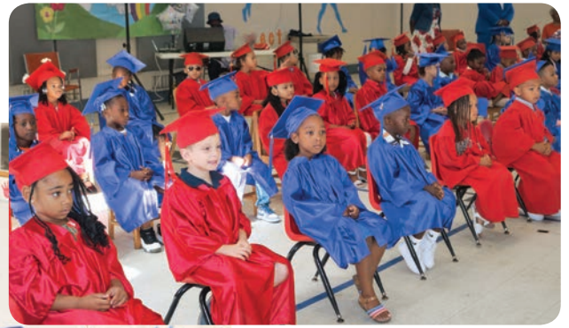
The graduates wait to receive their diplomas from their teachers.