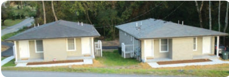
These four units are the most recently completed for our Transitional Living program.