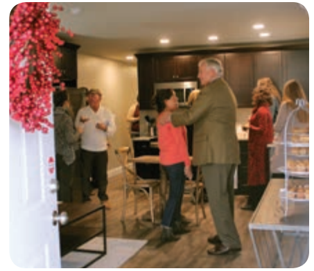
Board members and staff gathered inside one of the completed Transitional Living Phase 2 units to tour the interior.

All other initiatives have been completed, thanks to your tremendous support! We are grateful to all who were a part of the many contributions, both financial and in-kind, that allowed us to fulfill these goals to serve more children, youth, and families.