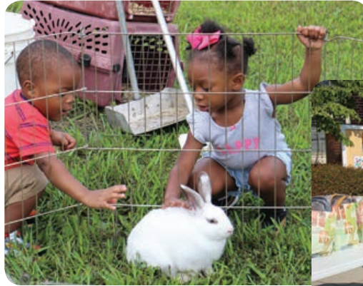
Our Tumblers were sweet and gentle as they learned how to pet a bunny rabbit.