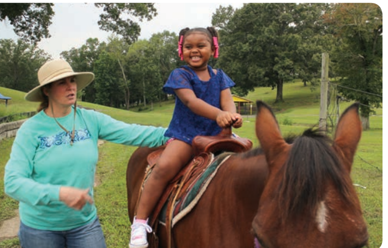
All of our kids loved the pony rides around our campus, especially Italia , pictured here.