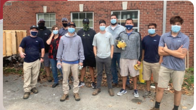
Volunteer groups like Southeast Restoration of Chattanooga cleaned out the old maintenance shop to get ready for the move.