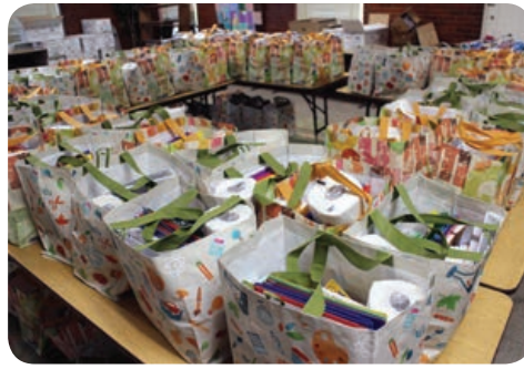
One hundred plastic tote bags were filled to the brim with school supplies for our kids, thanks to the continuous support of our friends at Unum .

The start of school wouldn't be complete without our friends from Unum! Unum hosts an annual Back to School Bash to celebrate the end of summer and the beginning of a brand-new school year. Volunteers from Unum also donated and assembled the required school supplies for 100 children in our program to help them get the year started. While the 2020 Back to School Bash looked a little different, we are still so thankful for our wonderful friends at Unum for their continued support of our agency and the children we serve.