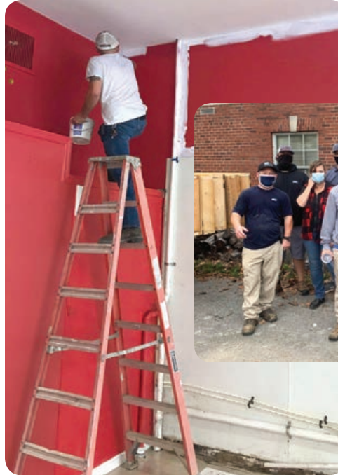
Our new maintenance shop at the soon-to-be Chester Ault Building needed a little TLC from our awesome volunteers.