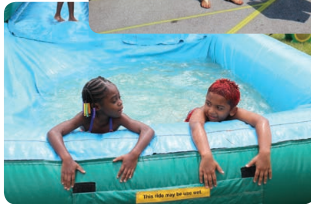
Our school-age children enjoyed inflatable water slides in the afternoon.